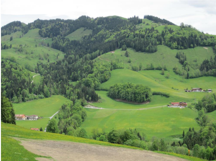
Typical landscape of farm location