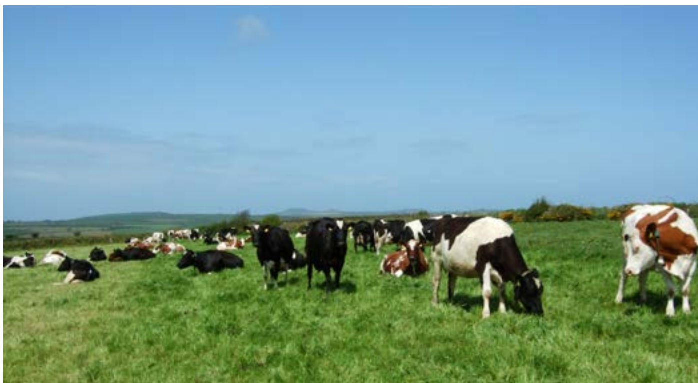
Dairy cows grazing in Wales

Beyond the SOLID project, the tool has great potential as an advisory tool to help to demonstrate how a farm is doing, to identify priority areas for improvement and assess changes over time. Such assessment and benchmarking provides a measurable and effective means of delivering more sustainable farming.